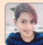
Sithra Paranjothy Health supplements review & approval Singapore